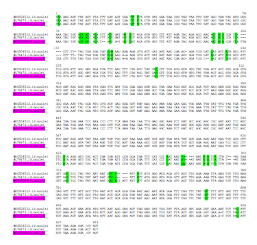
Fig. 2: Multiple sequence alignment of the partial 18S rRNA gene derived from the comparative analysis of the Iranian S. moulei isolated from slaughtered sheep and previously S. moulei strains deposited in GenBank

Thirty PCR products of the 18S rRNA gene were successfully sequenced. Each PCR product yielded a fragment containing 850 to 1021 consensus nucleotides. Overall, 20 out of 30 samples (66.7%) and six/thirty (20%) isolates had a similarity of more than 98% and 100% coverage to S. gigantea accession number KC209733 or L24384 and S. moulei accession number L76473 or KC 508513, respectively (NCBI GenBank). 13.3% isolates showed a similarity of more than 89% and 50% coverage to Sarcocystis spp. accession number GQ131808. Multiple alignments showed some variation in the consensus sequences of the isolates obtained in the current study compared with previously published S. gigantea isolates and with each other (Fig. 2). The same results were observed for S. moulei (Fig. 2). A phylogenetic tree of three S. gigantea, two S. moulei and some published sequences (NCBI GenBank) is shown in Fig. 3.