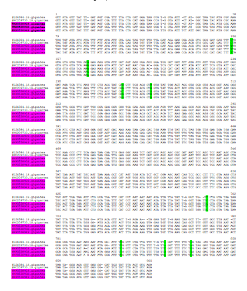
Fig. 1: Multiple sequence alignment of the partial 18S rRNA gene derived from the comparative analysis of the Iranian S. gigantea isolated from slaughtered sheep and previously S. gigantea strains deposited in GenBank

The partial sequence of the 18S rRNA gene of three S. gigantea and one S. moulei isolates have been deposited in the NCBI database under the accession no. KP053892, KP053893, and KP053894 and KP053891, respectively.