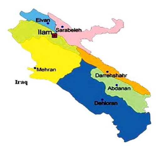
Fig. 3: Map of Ilam and its counties in 2014 from Iran Meteorological Organization (13).

(24) who both found the highest incidence in the 20-29 yr age group. By contrast, Maraghi et al. reported that in Shush, most cases appeared in patients of less than 10 years of age (25). Although the age pattern for cutaneous leishmaniasis varied, rural disease endemicity, parasite species, and host genome patterns increased in incidence in the younger age groups, which indicates high endemicity for this part of the country (26). Evidence suggests that the epidemiological focus in Mehran can be categorized as hyper endemic (Fig. 3).