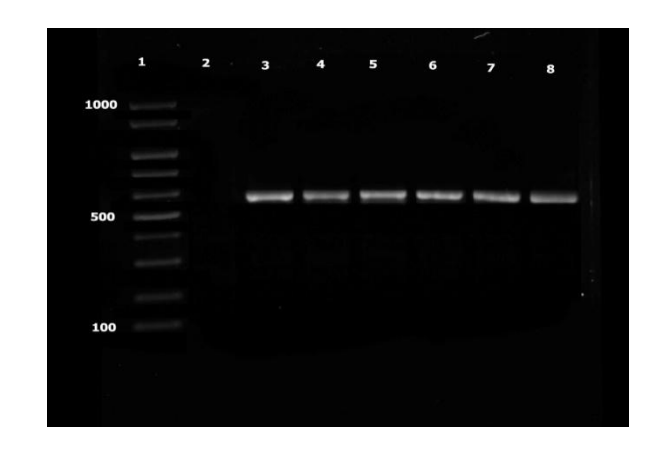
Fig. 1 : Agarose gel electrophoresis of Leishmania isolates. Lane 1, DNA size marker 100 bp; lane 2, negative control; lane3, L. major (positive control 560 bp); lanes 4, 5, 6, 7 and 8, L. major isolates obtained from skin lesions of the patients in Mehran

The Leishmania bodies of the 92 isolates were detected by microscopic observation. The samples were all tested by PCR technique. Electrophoresis of the nested PCR products and comparison of the banding patterns with those of the standard samples showed that the bands of all 92 isolates were 560 bp in length, which is standard for L. major (Fig. 1).