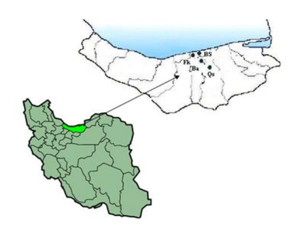
Fig. 1: Map of North Iran showing the municipalities with samples of Parmacella ibera and Limax keyserlingi examined for nematode larvae (Ba, Babol; Bs, Babolsar; Fk, Fereidonkenar; Qs, Qaem Shahr)

Mazandaran province is located in north of Iran (50° 34'E, 36° 47' N) with average rainfall of 700 mm, temperature 17°C, and humidity 79-80%. The province has four distinct seasons: cold season (January to March), spring (March to June), summer (July to September), and fall (October to December). The area of study is semi temperate with wet climate that divided into four sub-areas, i.e. Fereidonkenar, Babolsar, Babol, and Qaem Shahr (Fig.1).