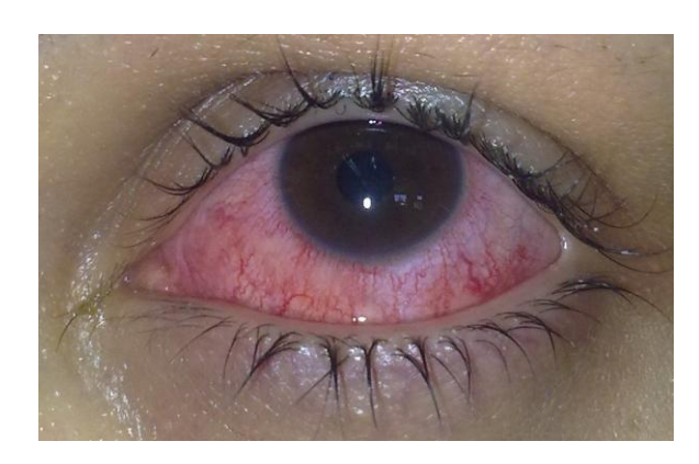
Fig.1: Clinical photograph of the patient at the admission time

and anterior stromal regions. No typical cyst or trophozoite-like structures were present on confocal scans. The confocal scan features were not suggestive of an Acanthamoeba keratitis.