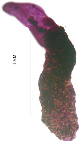
Fig.1: Photomicrograph of Lutztrema ( Lutziella ) microacetabularae , holotype