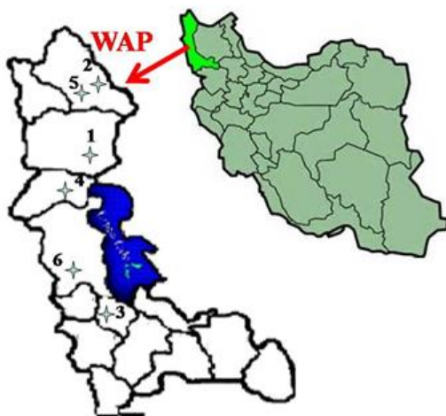
Fig.1: Map of West Azerbaijan Province, north-western Iran (WAP) and the study sites. 1: Shabanlu; 2: Marganlar; 3: Shorgol; 4: Qarabaagh; 5: Ghargolgh; 6: Gharahaghaj

Field-collection of the lymnaeid snails was undertaken in six freshwater bodies located in both mountainous (altitudes over 1000m above sea level) and plain areas of northern, central and southern parts of West Azarbaijan over a period of eight months from May to December 2010 (Fig.1). The collected snails of each site were placed individually into the plastic screw-capped containers and transferred alive to the Laboratory of Malacology of Faculty of Veterinary Medicine, Urmia University. Of 6,759 collected lymnaeid snails, the snails of L. gedrosiana were identified using the identification keys provided by Mansoorian (21) and Pflieger (36). The identities were then verified by the Parasitology Museum of the Faculty of Veterinary Medicine of Tehran University.