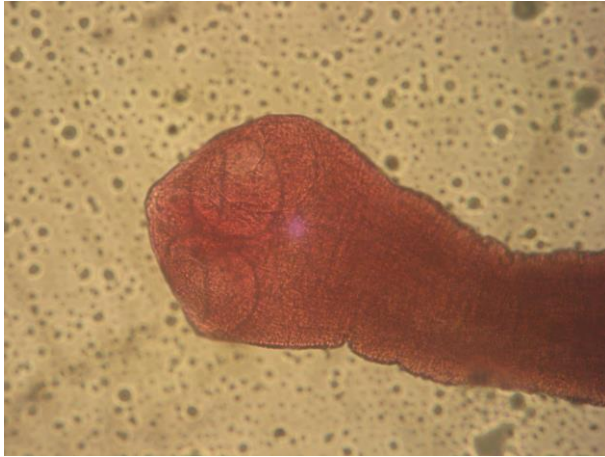
Fig. 3: Scolex of Hymenolepis erinacei obtained from Hedgehog small intestine