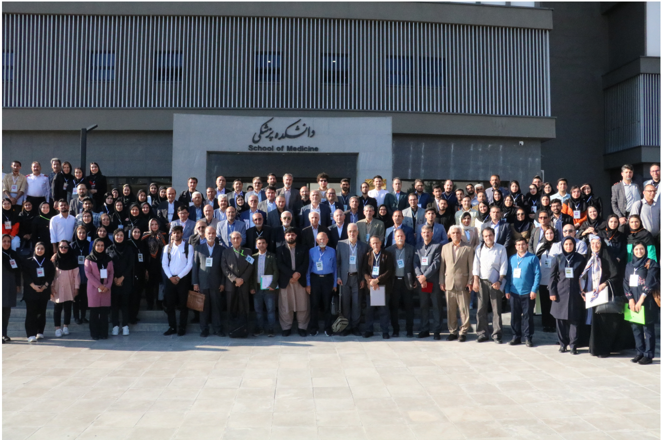
Fig. 4: Group photo of NICOPA 12 participants