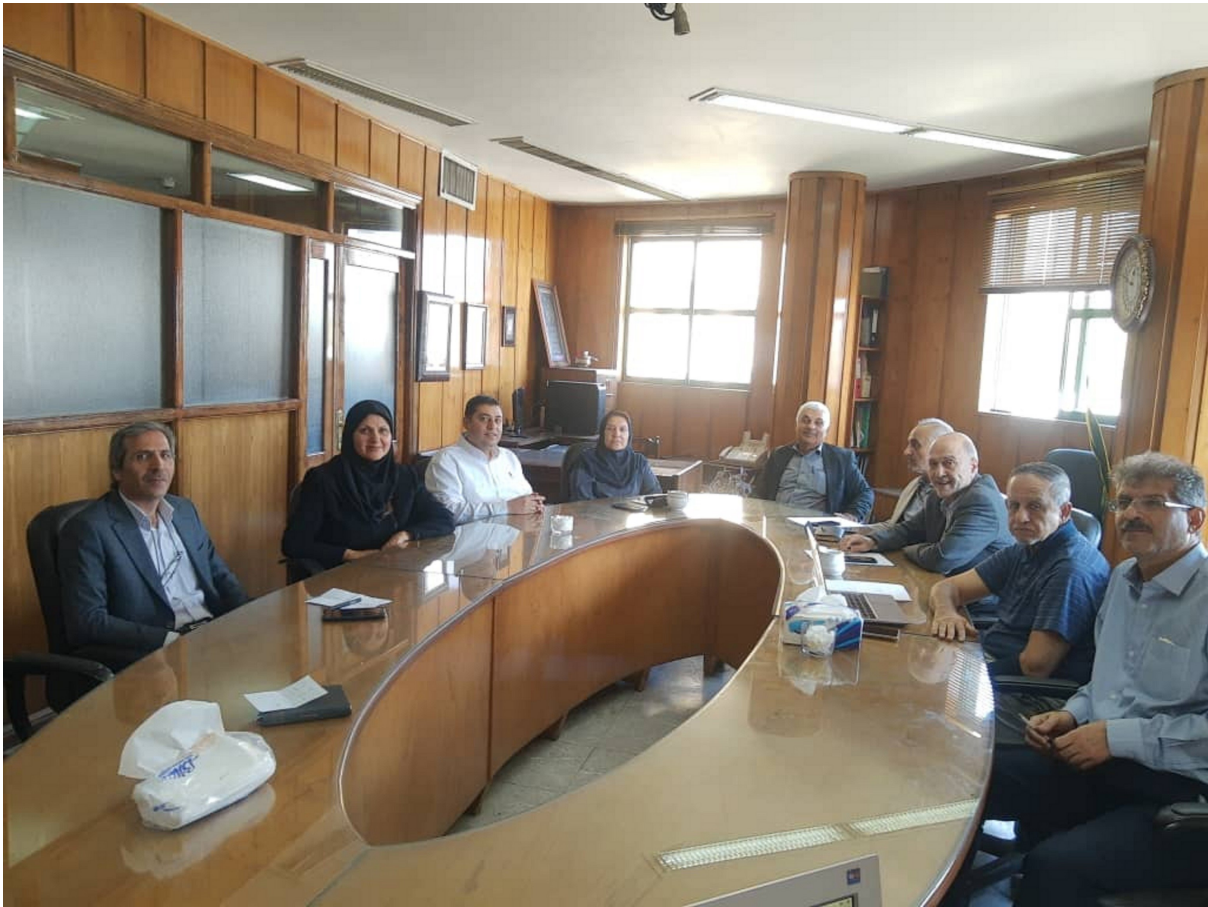
Fig. 2: Some members of the Organizing Committee of the 12th NICOPA

During this three day congress, over 650 scientists from Iran and 8 other countries came together to present the latest advances and transformative sciences on the Parasitology and parasitic diseases. At NICOPA 12, there was a strong emphasis on highlighting the achievements of young parasitologists who had made major advances in diagnosis and treatment. Participants were invited to submit scientific contributions, as oral presentations or posters (January 10 to March 10, 2024). After evaluation of the 503 received abstracts, the scientific committee selected 80 of them for oral presentations, and accepted 370 as posters.