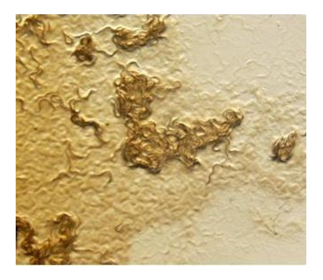
Fig. 1: Presence of numerous Strogyloides stercoralis larvae in microscopic surface view of agar plate culture of a patient with hyperinfection syndrome (Original)

Parasitic load of S. stercoralis infected patients were categorized in three ranks: -Low infection: direct smear and FECT negative, 1-4 larvae counted on agar plate surface; -Moderate infection: direct smear negative, FECT positive, 5-10 larvae counted on agar plate surface; -High infection: direct smear and FECT positive, more than 10 larvae counted on agar plate surface. Among third group, those cases with enormous number of larvae in their stool examinations (Fig.1), and presence of severe pulmonary symptoms were also recorded as hyperinfection.