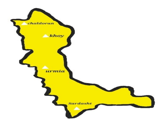
Fig. 2: The cities which were studied in this article

This study was carried out in the West Azerbaijan Province, located in Northwestern Iran, during March 2016. Four cities in the West Azerbaijan province in Northwestern Iran were chosen for sample collection: Urmia (37°32'59.99"N,45°05'60.00"E), Chaldoran (39°03'32.40"N,44°23'4.79"E), Sardasht (36°12'60.00"N,45°28'59.99"E) and Khoy (38°33'5.39"N,44°56'31.19"E) (Fig. 2).