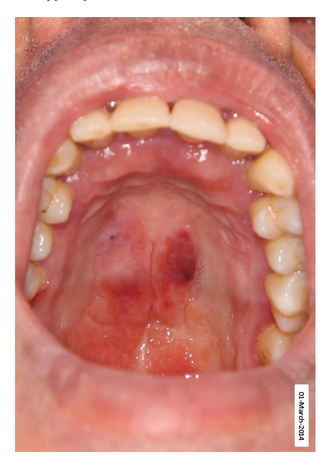
Fig. 2: Oral mucosal lesion: an erythematous plaque on the palate near the opening of the pharynx

Available at: http://ijpa.tums.ac.ir 297