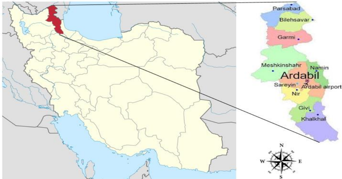
Fig. 1: Left: map of Iran highlighting the study area, Ardabil Province, Right: map of Ardabil Province showing the capital, Ardabil, and different counties of the province

A written epidemiological questionnaire and informed consent form including the demographic characteristics i.e., age, gender, residency, occupation, contact with dogs, eating uncooked vegetables and history of disease were completed by the individuals. The study was approved by Ethical Committee of Ardabil University of Medical Sciences (IR.ARUMS.REC.1397.264).