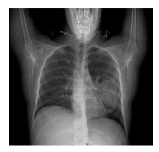
Fig. 1: CXR; the lung large hydatid cyst is in left side

We examined a 26-year-old nulligravida woman with a known case of liver and lung hydatid cysts who had an unplanned pregnancy referred to the hospital. During the pregnancy, the patient was monitored for symptoms of the illness. She had severe and frequent coughing. During the first two months of pregnancy, the lung large cyst ruptured, causing the enlargement of cysts size (Fig. 1, 2). She was recommended to have an abortion before surgery.