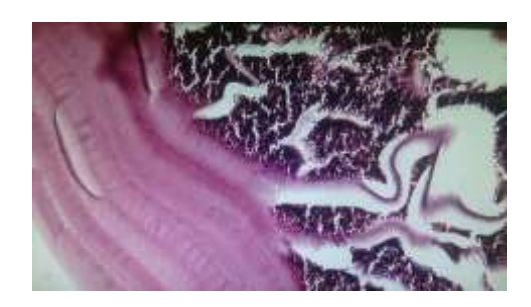
Fig. 1: Laminated collagenous layer, hydatid cyst (X1000)

human cyst samples, were subjected to genotyping of E. granulosus using the nad1 and cox1 genes. From all samples, 49 (68.06%), 19 (26.38%) and 4 (5.56%) were from liver, lung and spleen, respectively. Overall, 43 (59.73%) of cysts were from male and 29 (40.27%) were from female patients.