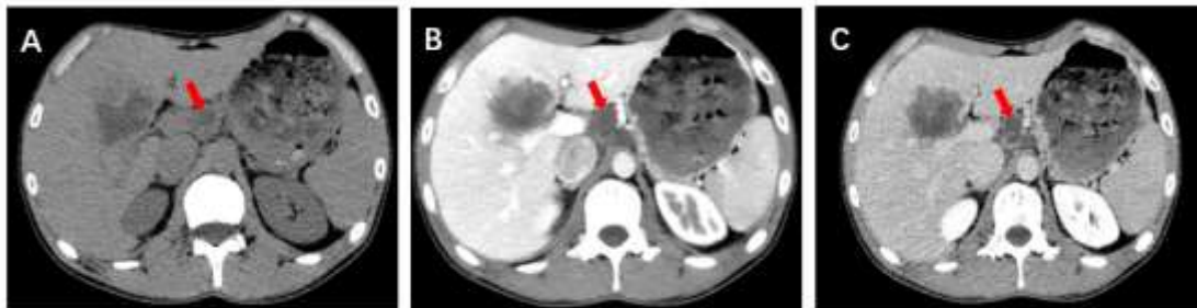
Fig. 1: CT plain and enhanced scan.

The abdominal computed tomography (CT) showed lesion located in S4-5-6 and slightly low-density lymph node existed in the hepatogastric space with diameter of 2.13 cm (the lesion on maximum diameter was not displayed in order to show the lymph node better, Fig. 1. A, B and C). Branches of right hepatic artery and portal vein were close to the lesion. It was suspected of hepatic alveolar echinococcosis (P2N1M0, based on expert consensus of alveolar echinococcosis (4)) with regional lymph node metastasis. In addition, there were several cysts in the liver. No special findings were found in the lung and brain scans. The results of magnetic resonance imaging(MRI) scan also considered hepatic alveolar echinococcosis (Fig. 2. A, B and C).