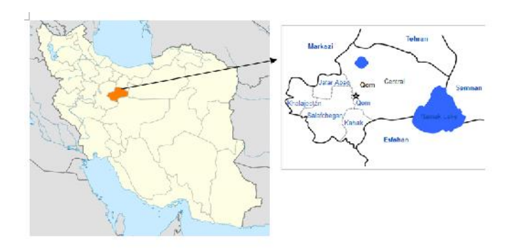
Fig. 1: Status of Qom Province in Iran

tions out of which 356 are populated (Source: http://amar.sci.org.ir/index_e.aspx).