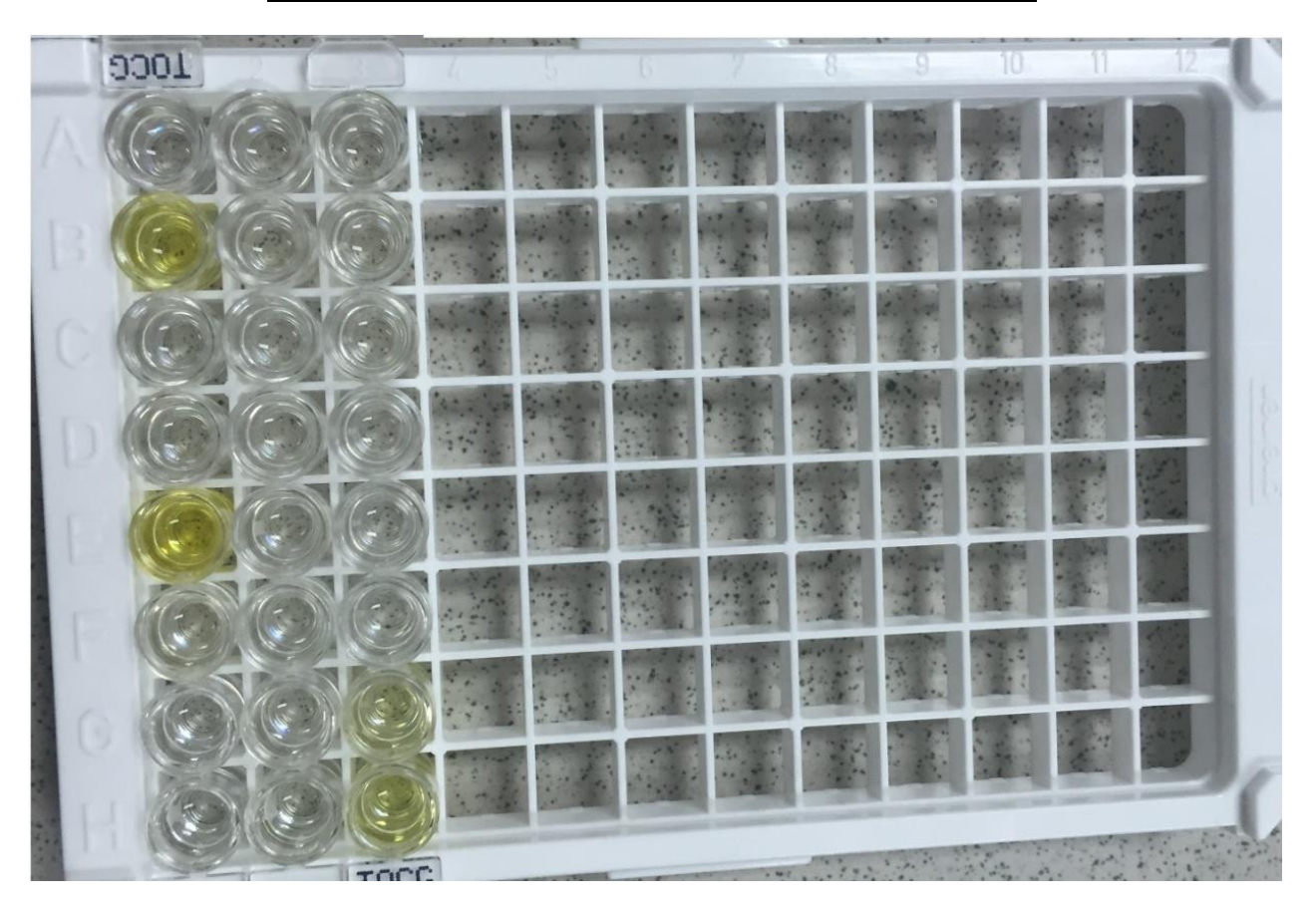
Fig. 1: Two patients (B and E) with ocular T. canis IgG antibody in ELISA kit

As mentioned in Table 2, one of the patients was a 45 yr old female from coastal city of Caspian Sea who had history of visual deficit in the right eye since childhood. She presented