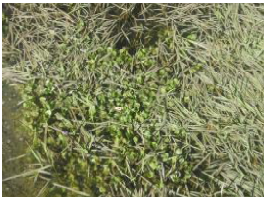
Fig. 2: Wild freshwater plant Nasturtium microphyllum (Local name Bakaloo) commonly used in Yasuj district