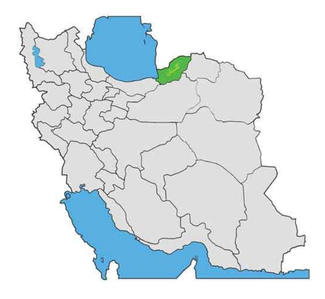
Fig. 1: Location of Golestan Province in Iran, showed in green color

This descriptive cross-sectional study was conducted from Feb to Jun 2017 in Gorgan City, capital of Golestan Province, Southeastern the Caspian Sea, north of Iran (Fig. 1).