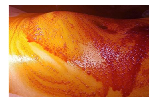
Fig. 1: On the abdominal wall, the bump depending on the cyst below the umbilicus

A 12-year-old female patient was brought to Department of Pediatric Surgery, Firat University School of Medicine, Elazig, Turkey in 2017. She had been suffering from abdominal pain in her suprapubic region for one week. In her physical examination, a lump having smooth surface was determined underneath the skin in the suprapubic region (Fig. 1). It was swollen, tense, partially firm and movable. The diameter of the mass was measured approximately 10 cm. Her hemogram and blood biochemistry were within the normal ranges. There was opacity in the standing direct abdominal radiograph (Fig. 2).