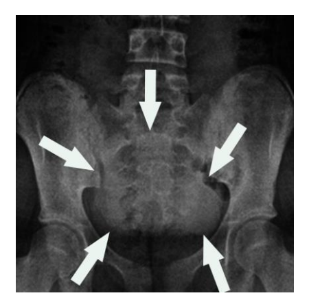
Fig. 2: Radioopaque area in the standing direct abdominal radiograph

Considering the ultrasonography (US), there was anechoic cystic lesion with the sizes of 6.5x9.1 cm in her bladder superior. The thickness of the cyst wall was 2 mm and the vascularisation was not monitored on the wall. The differential diagnosis was mesenteric cyst, lymphocyst, and urachal cyst because of its existence in the midline. In MRI of the lower abdomen, a cystic mass, which completely filled the midline from the promontorium to the anterior abdominal wall, was determined (Fig. 3). It was pure cystic, contrasted, and measured as 9.7x7.8 cm (mesentery cyst?). The mass caused ondulation on the muscles of the anterior abdominal wall. Preoperative intravenous cefotaxime and metronidazole were started. Due to the early diagnosis of mesenteric cyst, laparoscopy was applied at the beginning of the surgery. The cystic mass was not in the intraabdominal, it was seen in the urachal area of the anterior abdominal wall over the periton. Approximately 300 cc of cyst fluid was emptied with an injector from the abdominal wall. This process reduced the tension of the cyst. The cystic mass was not in the abdomen so the laparoscopy was stopped.