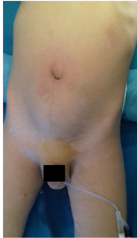
Fig. 1: Hypogastric mass associated to a communicating left vaginal hydrocele

He presented to the clinic with abdominal mass. He had a history of left recurrent hydrocele operated on twice. On examination, a mass approximately 6 × 8, 5 cm in diameter was identified in hypogastric region. External genitalia examination was suggestive of recurrent communicating left vaginal hydrocele (Fig. 1). Abdominal ultrasound showed a well-defined, anechoic cystic mass, seat of a floating membrane (Fig. 2). An intraperitoneal hydatid cyst, located above and behind the bladder and a complete persistent peritoneal-vaginal duct were concluded. Chest radiography and ultrasonography showed no coexisting thoracic or liver hydatid disease. Laparotomy was performed, and upon entering the peritoneal cavity, we found a large cystic mass arising from sigmoid mesocolon (Fig. 3).