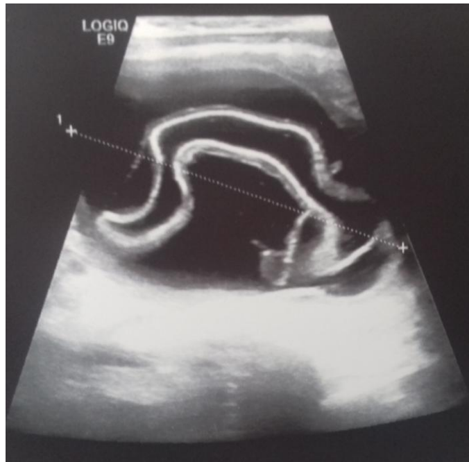
Fig. 2: Abdominal ultrasound showed a well-defined, anechoic cystic mass, seat of a floating membrane