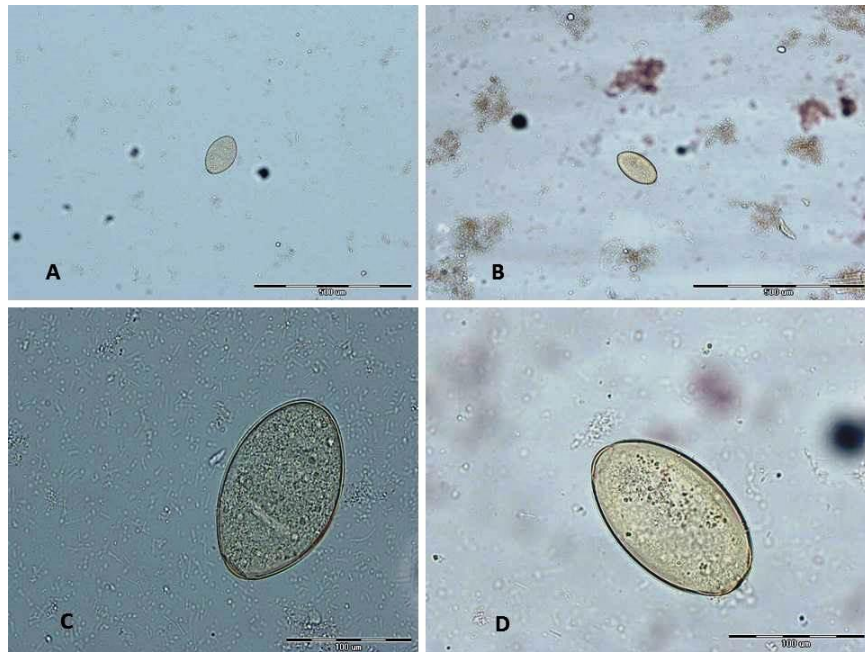
Fig. 3: Ova of Fasciola in stool examination. A, B: With \times 100 magnifications C, D with \times 400 magnifications (These pictures were originally captured in this study.)

While some previous studies have reported the seroprevalence as gender-specific (4, 20-25), no significant difference between genders was observed in our study. This result was in arrangement with several similar studies (13-15, 26-33).