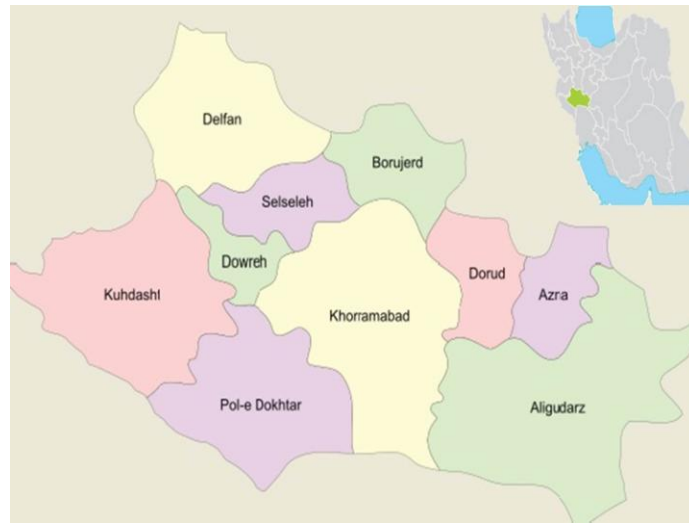
Fig. 1: Location of Lorestan Province in Iran

The samples were collected in accordance with the population of each city. Based on a random sampling, people were asked to present in health centers for collecting sera. Each patient filled a questionnaire including information on food diet, vegetable consumption, travelling to northern Iran, clinical symptoms etc.