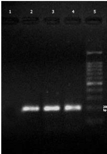
Fig. 1: PCR products of TVV1 in Iranian T. vaginalis isolates. Lane1: Negative control; 2: Positive control; 3, 4: virus positive T. vaginalis samples (204bp); 100 bp DNA ladder marker

Two new isolates of T. vaginalis were collected from 200 vaginal samples were negative in points of infection to TVV-1 and overall 10 T. vaginalis isolates, only four T. vaginalis isolates infected to TVV-1 (Fig.1) and six isolates were free of TVV-1 infection.