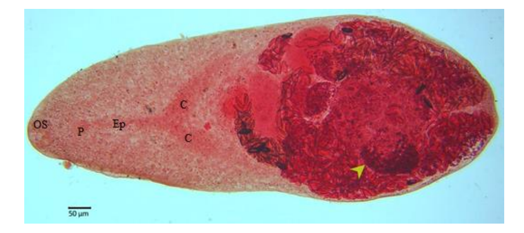
Fig. 2: The fluke recovered from a Jackal ( Canis aureus ) in Khuzestan Province. The "OS" shows oral sucker, "P" pharynx, "Ep" esophagus, "C" cecal branches, and the arrow (►) the single testis, a characteristic feature of the genus Haplorchis

near to the posterior end of the worm. The ovaries were hardly visible, but many light brown \approx 25 \times 14 \ \mu m eggs were visible in the uterus. Valid identification of the species was not possible as the distinctive features, i.e., the genital sucker, and the arrangement of the spines in the ventro-genital complex were not recognizable (Fig. 2).