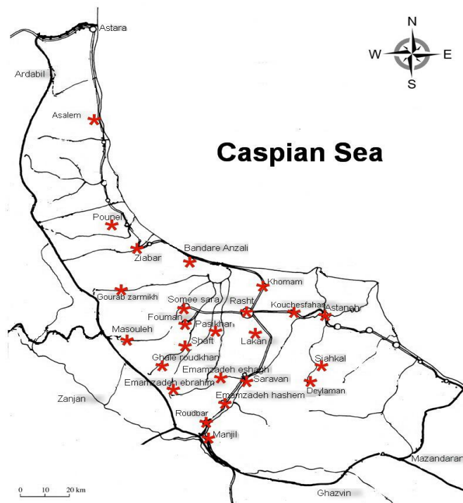
Fig. 1: The collecting locations of road killed carcasses in Gilan Province

Recovered helminthes were stored in 70-degree ethanol while the specimen condition aiming to morphological identification such as body relaxation and flattening were done for cestodes, specifically. For tapeworms, carmine acid staining, and for transparency of nematodes lachtophenol solution were used. Classical identification for the helminthes has been finalized by the use of reliable key references (11-13).