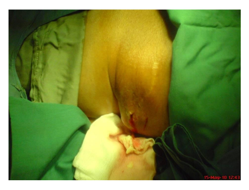
Fig. 3: Washing the cavity by silver nitrate and drainage of the liquid from that (Original)

Available at: <a href="http://ijpa.tums.ac.ir">http://ijpa.tums.ac.ir</a>