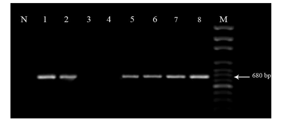
Fig. 1: Amplification of partial cytochrome c oxidase subunit 1 in mitochondrial DNA, using primers new DirF and DirR Primers. Six positive isolates that were amplified 680 bp PCR products showed as lanes 1, 2 and 5 to 8, negative isolates (lanes 3 and 4), non-template control (lane N), molecular size marker (lane M)

under the accession numbers KR870344. Phylogenetic tree rooted by out-group ( Thela-zia callipaeda ), inferred from partial cytochrome c oxidase sequences. All D. immitis records appeared as sister clade and Kerman filarial isolate close to DQ358815 and AJ271613 records from Italy (Fig. 2).