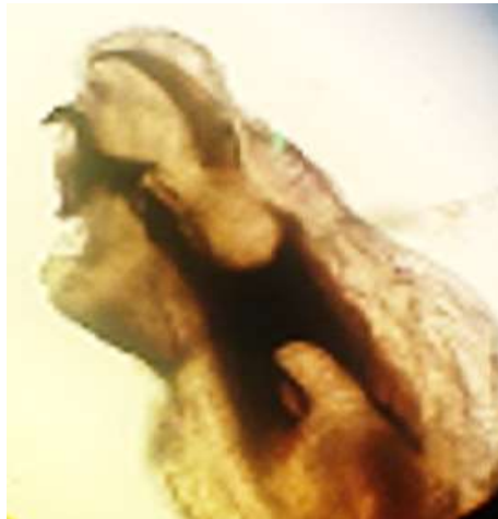
Fig. 3: Anterior end of larva and terminal oral hooks of Calliphora spp. larvae, 40X