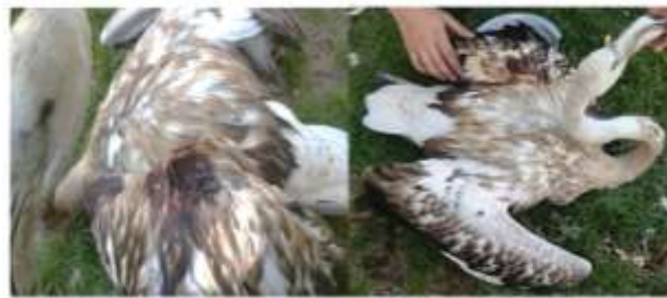
Fig. 1: The injured Flamingo ( Phoenicopterus ruber ) in the East Azerbaijan Province, Iran, Sep 2, 2016

At the initial examination, clinical signs were extended with a wound upper the left wing.