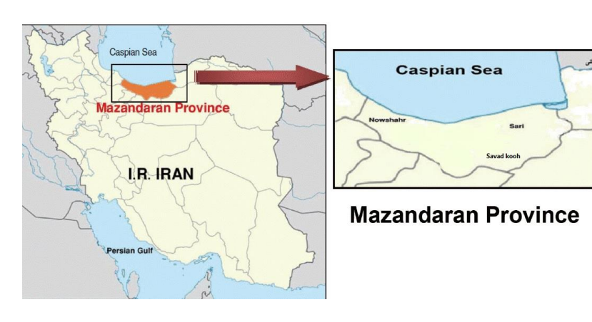
Fig. 1: Map of Mazandaran Province, northern Iran and 3 different cities (Sari, Savadkuh, and Behshahr), Iran

This study was conducted in the suburbs of 3 different cities (Sari, Savadkuh, and Behshahr) in the Mazandaran Province, Iran. The Mazandaran province (36° 33' 56" N 53° 03' 32" E) is located in northern Iran on the southern coast of the Caspian Sea (Fig. 1). It covers an area of approximately 23842 km² and has a population of 2,922,432 individuals. This province has a moderate and subtropical climate and is geographically divided into the three regions: plains, forests, and mountains.