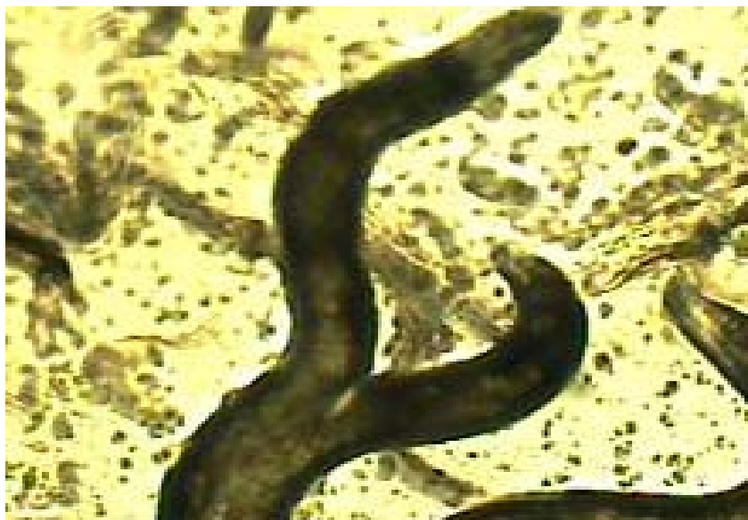
Fig. 2: A view of agar plate showing free living adults and larvae of Strongyloides stercoralis