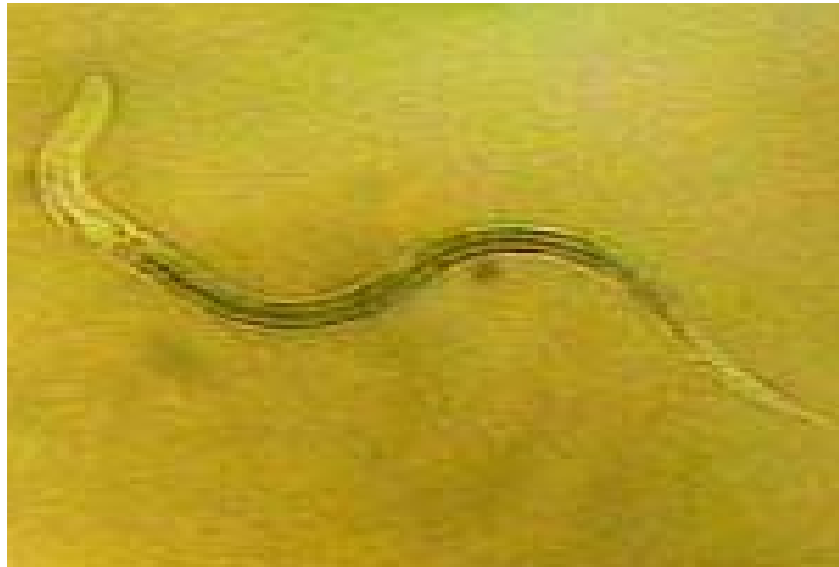
Fig. 1: Filariform larva of Strongyloides stercoralis on the surface of agar plate