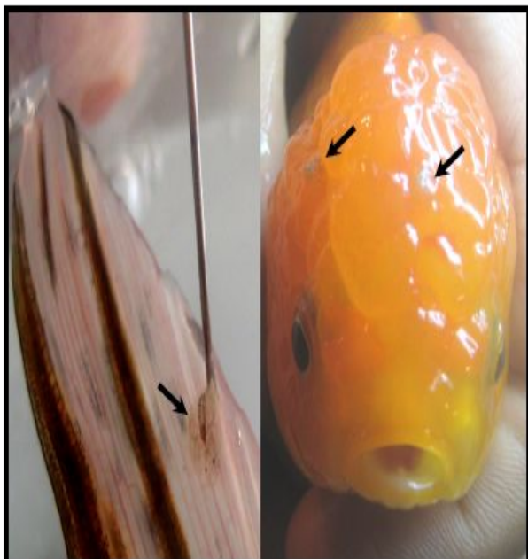
Fig. 1: Argulus foliaceus on the tail fin and head of goldfish