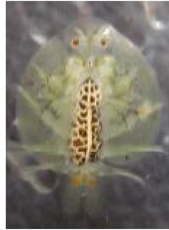
Fig. 2: Argulus foliaceus with rounded abdominal lobes

The owner was recommended to disinfect the aquariums and equipment to remove completely eggs, and treatment of fish with trichlorfon (0.25 mg/l at temperatures below 27 °C, or with 0.50 mg/l above 27 °C) (7). The bath was repeated twice a week and was found effective. During treatment, neither adverse effects nor mortality was observed throughout the trichlorfon bath. All fish were checked in terms of parasite following the treatment. No parasite was observed on the fish. Because the larvae emerged from eggs did not be affect from drug transformed into juvenile and then into adult stages, the symptoms were reappeared 3 weeks later and the drug administrated again at same dose. Although the source of contamination of the aquarium with A. foliaceus was not defined, marine sand contain live eggs was suspected.