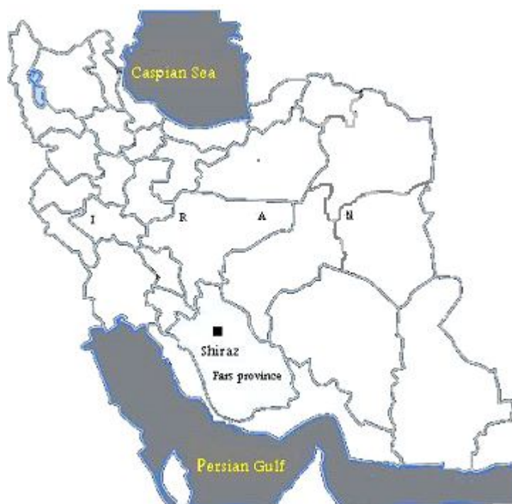
Fig. 1: The study area of Shiraz City, Fars Province, southwest Iran