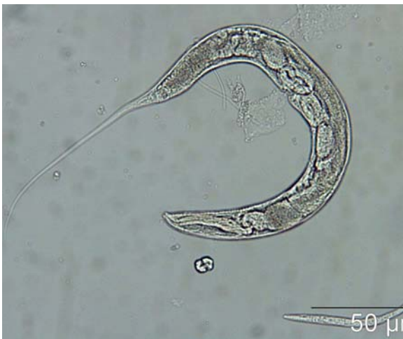
Fig. 1: Female of Rhabditis axei (400×)

**** There were 6 cases of coinfection with parasites.