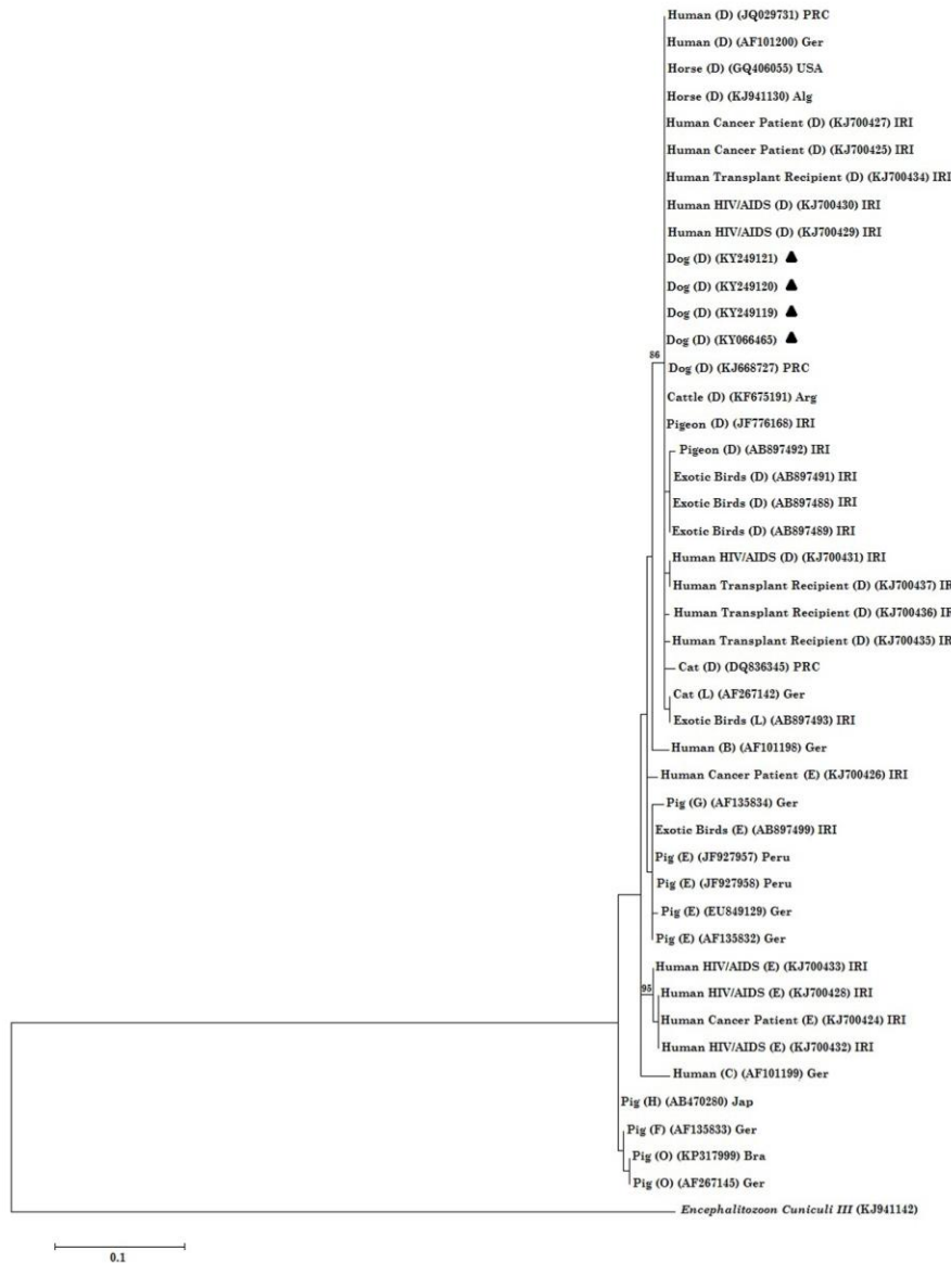
Fig. 2: Phylogenetic analysis of ITS nucleotide sequences of E. bienersi isolates recovered from stray dogs in Iran. The tree was constructed using the Maximum Likelihood test and the Tamura 3-parameter model as implemented in the MEGA6 software. En. cuniculi genotype III was used as an outgroup. Bootstrap under 75 were deleted. Abbreviations: Ger, Germany; Jap, Japan; Bra, Brazil; IRI, Islamic Republic of Iran; Arg, Argentina;