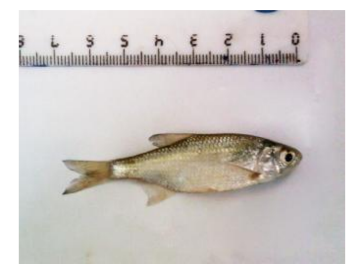
Fig. 2: Blicca bjoerkna (Sim Parak)