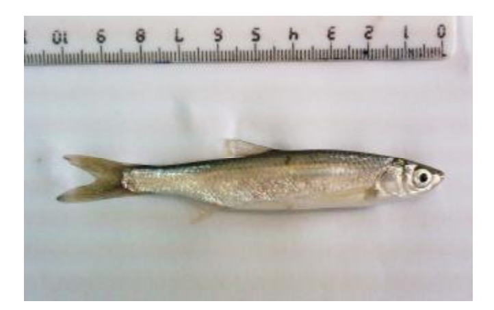
Fig. 1: Hemiculter leucisculus (Tiz kooli)

T. perforata, Ps. tomentosa and R. acus.