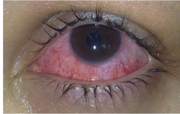
Fig.1: Clinical photograph of the patient at the admission time

and anterior stromal regions. No typical cyst or trophozoite-like structures were present on confocal scans. The confocal scan features were not suggestive of an Acanthamoeba keratitis.