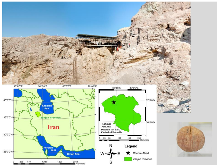
Fig. 1: Location of Chehrabad archeological site in Iran

T.crassicauda were retrieved from the pellet No: 264, while the analysis of the pellet number 266 demonstrated merely a single Trichuris sp. egg. Table 1, shows the number and the appearances of the coprolites and the measurements of the identified parasite eggs (Fig. 2).