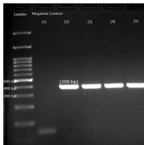
Fig. 1: PCR amplified nad1 fragments from human isolates of E. granulosus from Mazandaran, Iran. Ladder 100bp, lan1: negative control, lane 2-5: Positive sample

The nad1 mitochondrial gene was successfully amplified 10 of 47 FFPT samples (21.27%) of histologically confirmed E. granulosus gave positive results with the PCR, 37 (78.72%) showed no reaction. For all amplicons, the consensus length of 398bp nucleotides was obtained (Fig. 1).