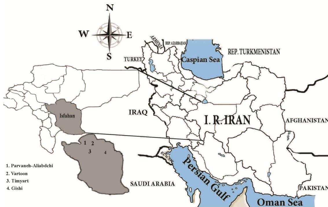
Fig. 1: Map of the Esfahan County, Esfahan Province, Iran, showing the geographical location and study areas

In the late April 2011, before the emerging of adult sand flies, the rodent burrows were counted and destroyed in a radius of 500 m from houses around all villages.